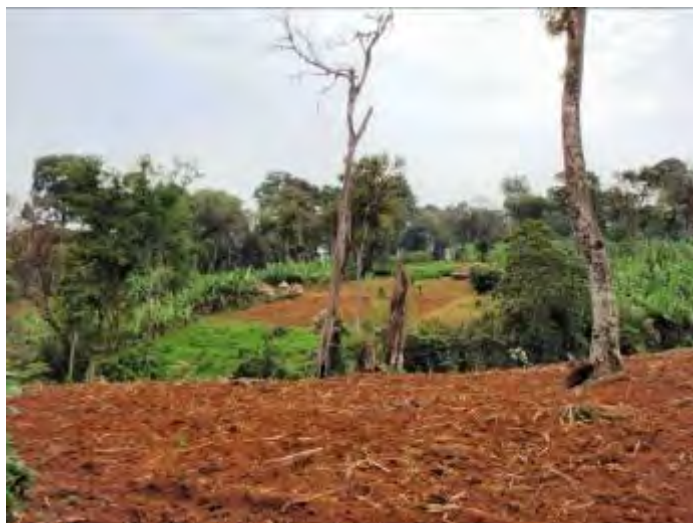
Deforestation for farming near Masha

While the predominant rate of deforestation over the last two decades is less than 2%, the rate in the most recent periods seems to be accelerating to 3% or above. According to the Woody Biomass Inventory & Strategic Planning Project (WBISPP) average annual deforestation is 28,916ha.